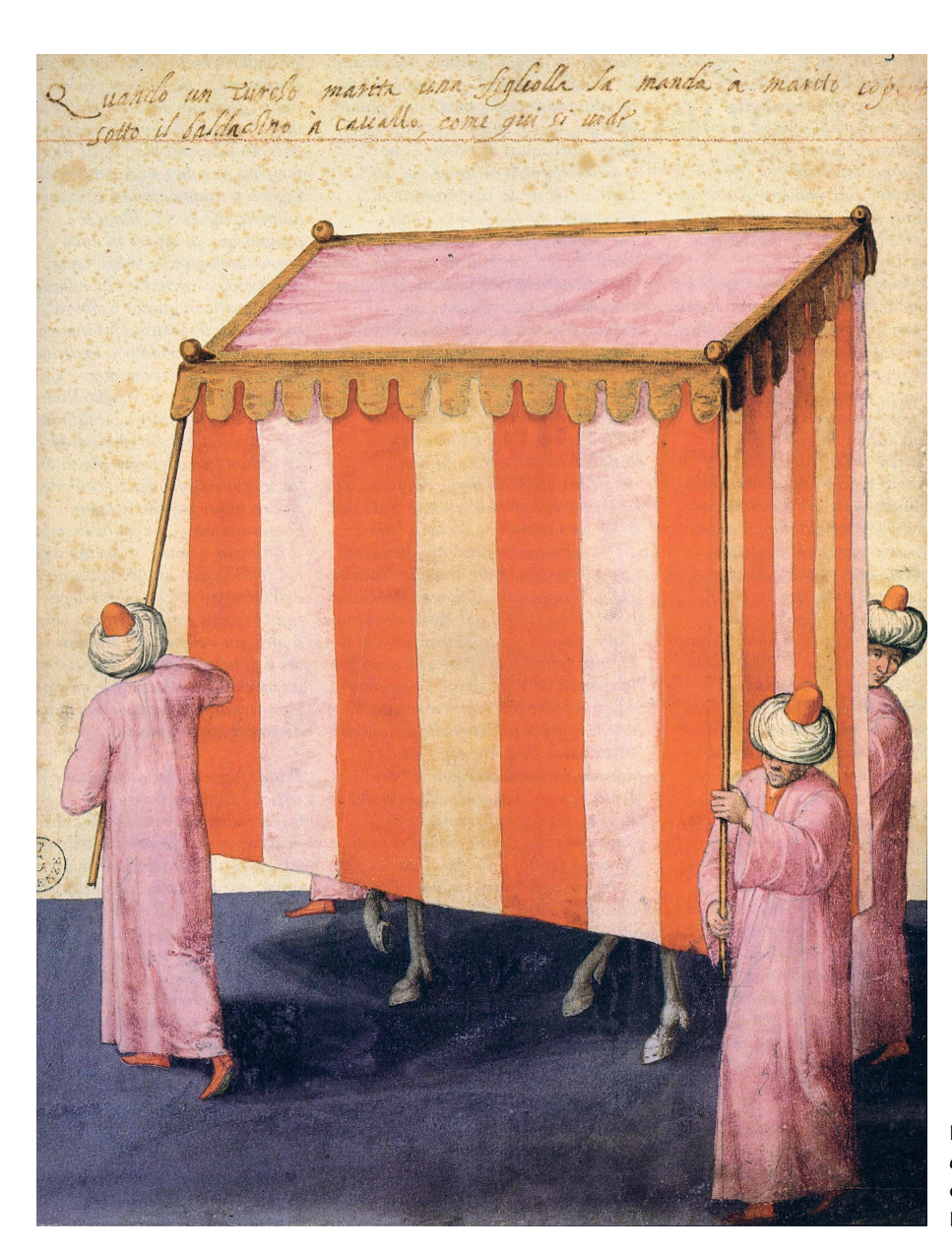
Fig. 3. Jacopo Ligozzi, Turkish bride conducted to her husband, watercolor drawing, Florence: Uffizi, Gabinetto Disegni e Stampe, Inv.nr. 2949F.

the sheet with Ligozzi's Turkish bride carried under a baldachin, a representation that particularly fascinated Western people. It can be found in the drawings of various albums brought home by European travelers during the 1570s. <sup>64</sup> This motif is also contained in all the books indicated above, some of which – like the costume books by Hans Weigel <sup>65</sup> and Cesare Vecellio <sup>66</sup> – presented the same theme, but were printed as a mirror image due to the process of graphic reproduction.