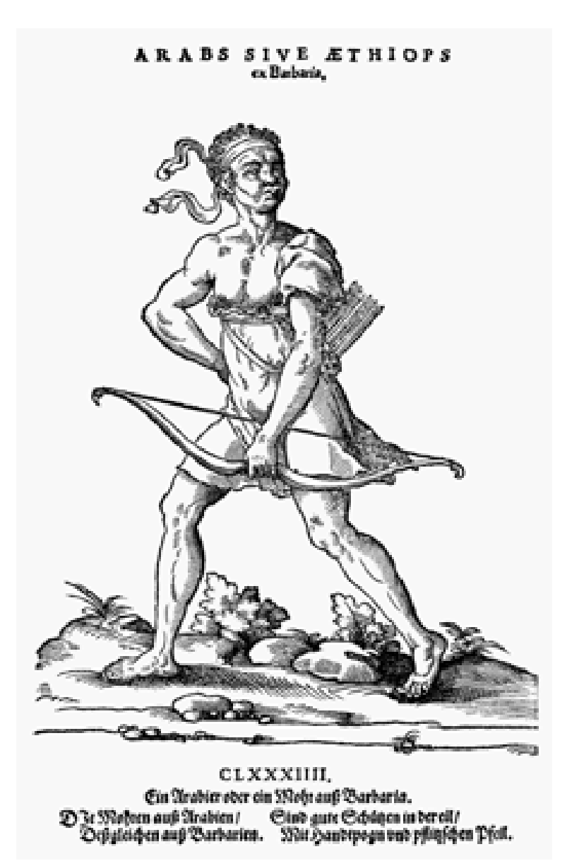
Fig. 5. Black man from Arabia, woodcut in Hans Weigel, Habitus praecipuorum populorum (Nuremberg: 1577), plate 184.

poene gentium imagines (Cologne 1577). He declared that the set of Turkish figures in his book were copied from some drawings that had been executed by some travelers while in Constantinople. However, it was even more common that during the process of transmission and copying, the artists and/or the editors lost track of the origins of the ethnographic images presented. This happened for example to Francesco Ziletti, the publisher of the 1580 Venetian edition of de Nicolay's travelogue (Fig. 4). To