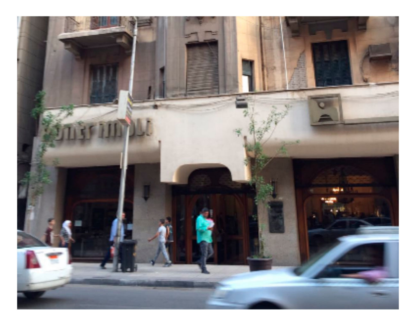
Image 2. Pontremoli store in Cairo, today.

Downtown Cairo. There, a furniture store once owned by Moise Pontremoli's cousin bears the appellation 'Pontrimoli [sic]' on its signage (the store was sequestered in 1956 and nationalized in 1961) (Shawky 2013). Inside, the portrait of his cousin who carries the name of the Pontremoli family patriarch still adorns the wall. (Images 2 and 3).