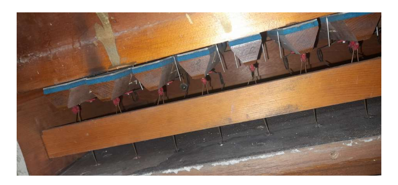
Pipes' Condition, Observations, Suggestions and C.E. (Register by Register Examine, Tuning, Voicing, Damages, Paintings, Materials i.e. Metal, etc...)

As observed during my visit, the organ has only a few metal pipes remaining which are the front and side façade and wood pipes which several of them are badly damaged. We already have contacted several organ builders who can be helpful for getting the metal pipe work and their price offers will be listed in the end.