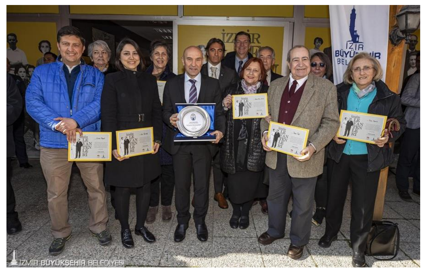
The opening of the 'Izmir Levantines' exhibition at Apikam, Izmir 10 February 2020 - gallery: