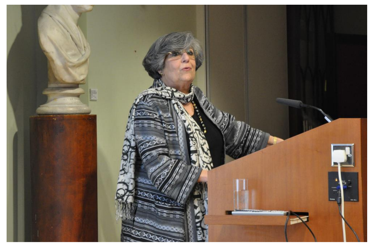
Joint event with the Egyptian Cultural Centre, London: Lecture by Prof Doris Behrens-Abouseif: 'Cairo through the lens of pilgrims and explorers from the Middle Ages to Napoleon', 15 January 2020 - <u>flyer</u>: - <u>video</u>: