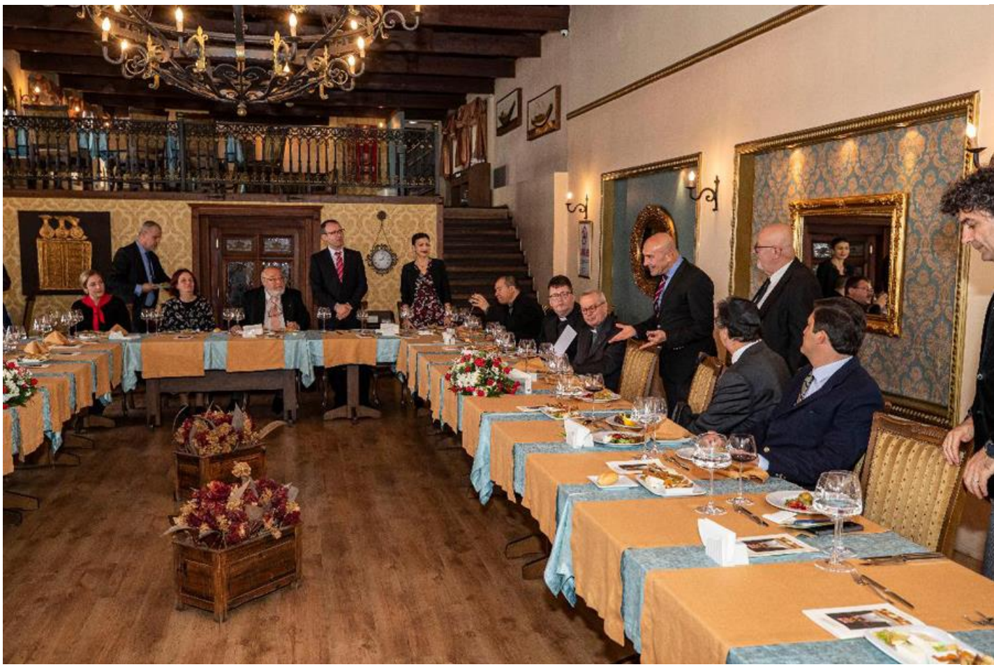
The lunch reception given by the mayor of Izmir Tunç Soyer at the historic elevator building in Karataş on 20 December 2019, welcoming the diverse community members of the city including a contingent of 10 Levantines of Izmir – gallery: