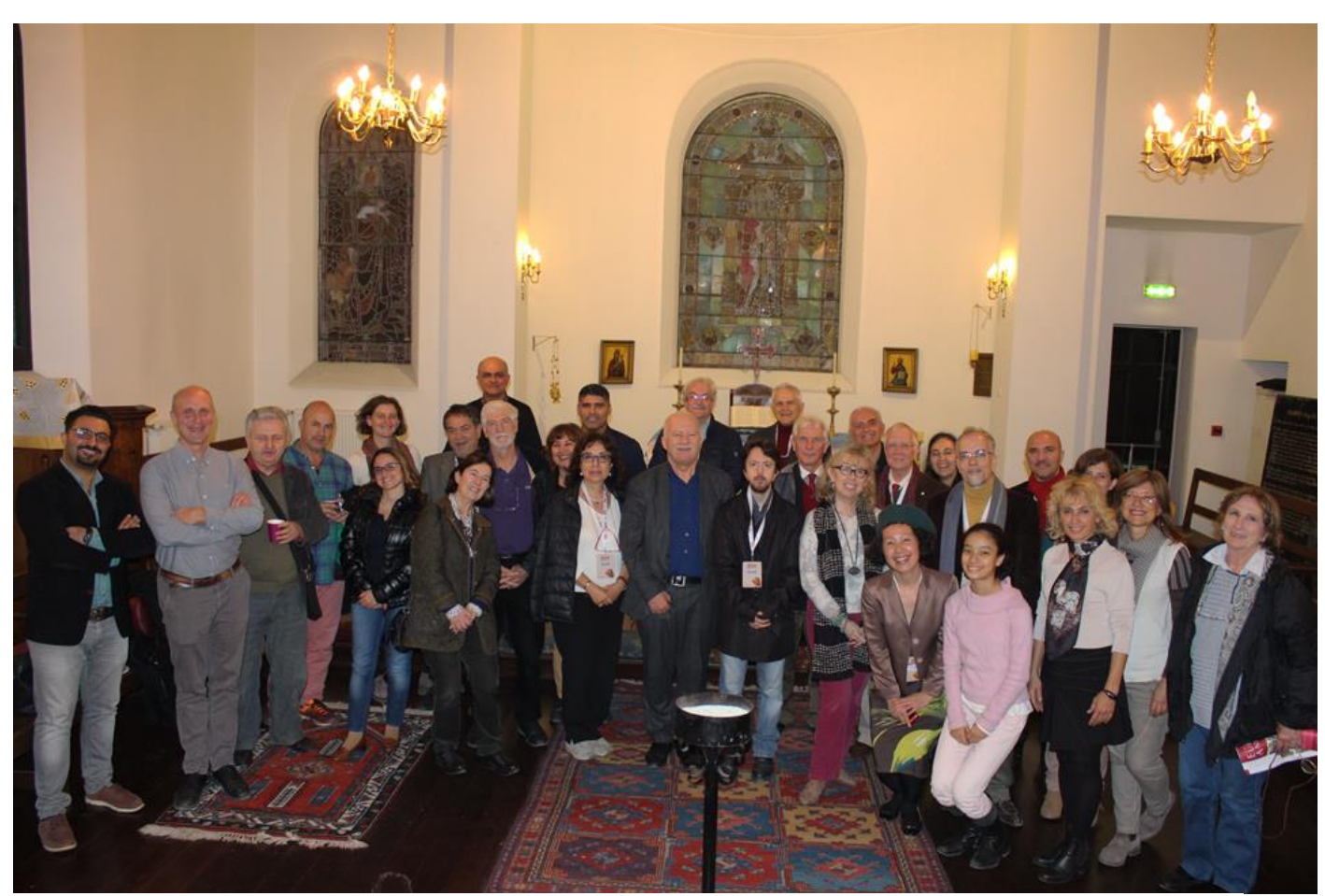
Some of speakers and delegates at the post conference reception.