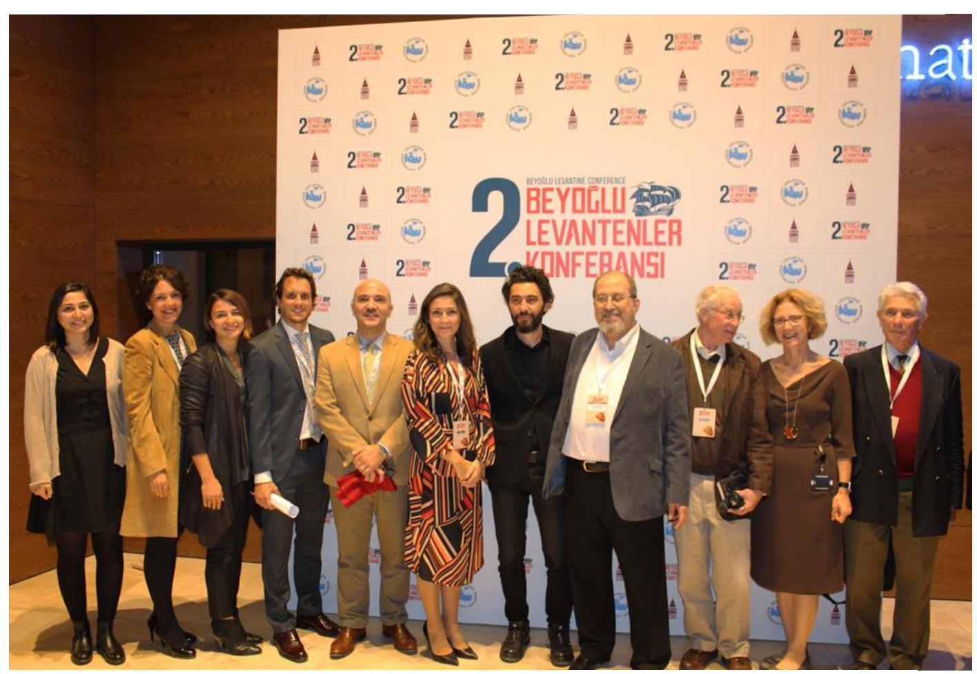
Some of the organisers of the conference.