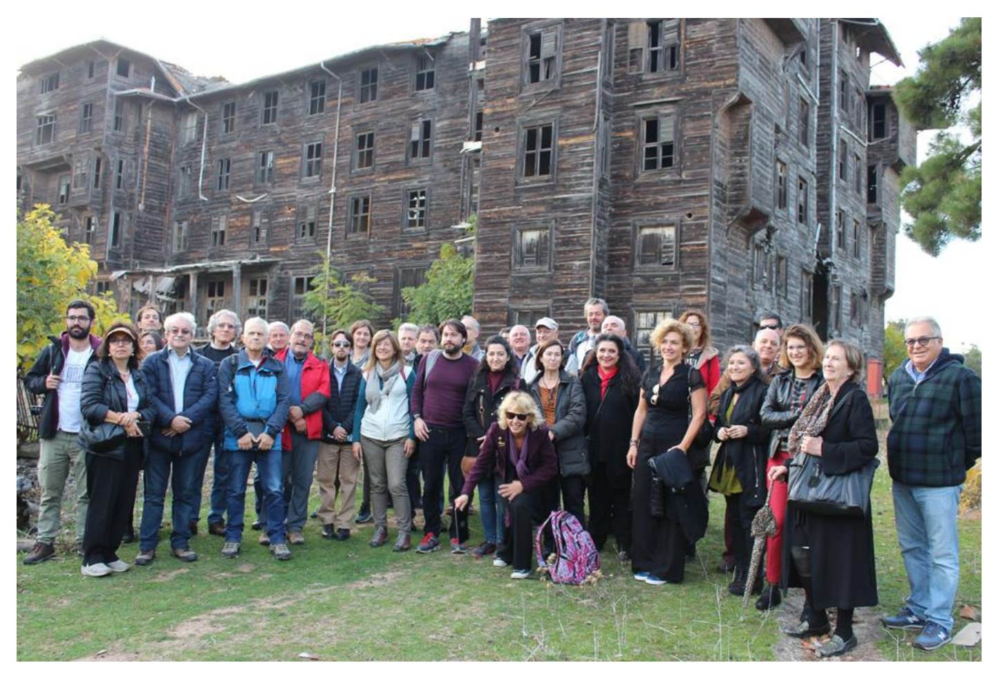
Some of the group during the one of the post conference tours: Büyükada.