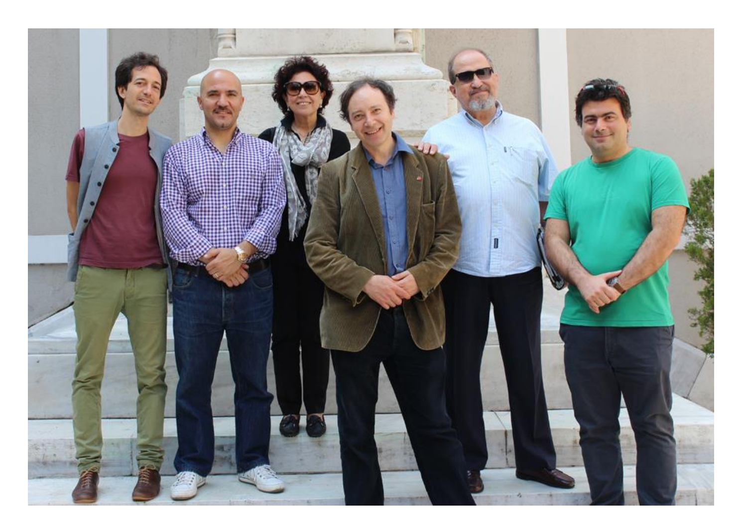
Gathering of members of the LHF-Istanbul sub-group, 5 June 2016, at the Catholic Cathedral of Saint Esprit

You have received this newsletter as you have indicated that you wish to receive this or have shown a past interest / contributed to our project. If you wish to no longer receive this communication, please e-mail us contact@levantineheritagefoundation.org to indicate you are no longer interested.