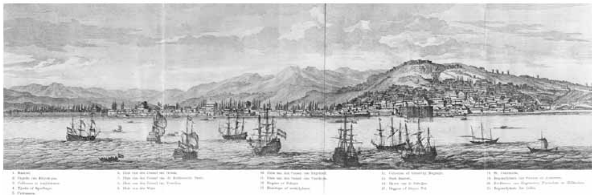
Cornelis de Bruijn, Reizen van Cornelis de Bruijn door de vermaardste deelen van Klein Asia (privately printed, 1698).

There were some exceptions, of course, only two of whom I will mention by name here. The first is Sir Paul Rycaut (1628-1700), the English consul there from 1667 to 1678, whose Present State of the Ottoman Empire long remained a standard work on the subject. However, this book appeared in 1665, two years before Rycaut went to Izmir. While his later work, on the history of the Greek Church, owed more to his residence in the Anatolian port, the author continued to rely on his networks in Istanbul to a large extent. 5 Equally learned, but less well known today is William Sherard, who was British consul in Izmir from 1703 to 1716. Sherard was one of the most prominent botanists of his day, and the founder of the botanical garden at Sediköy, near Izmir, the remnants of which still exist today. 6 In 1720 he was elected Fellow of the Royal Society, which he had served as an informant from Izmir. Sherard was a great scholar and scientist, who left many private papers about his period in Izmir. Unfortunately, Sherard's only published work, Schola Botanica (1689), tells us little about the place where he made his fortune, and his papers remain unpublished.