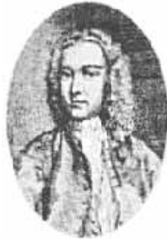
Portrait of Alexander Drummond.

Detail taken from the title page of his Travels .